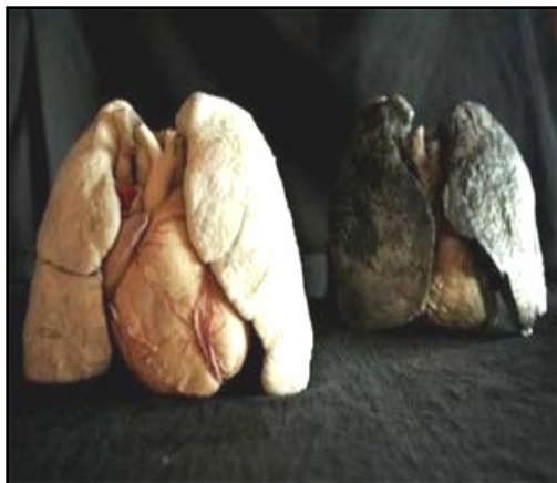
Healthy lungs on left. Smoker's lungs on right. Not a big surprise!

Half of all adult smokers (millions of people) have quit, so can you!